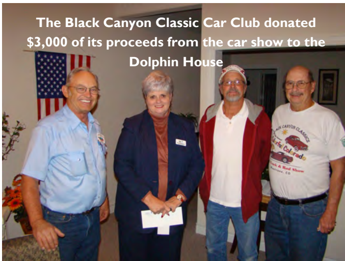
The Black Canyon Classic Car Club donated $3,000 of its proceeds from the car show to the Dolphin House