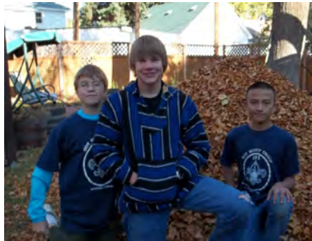
Boy Scout Troop 491 mows our yard all summer and rakes leaves in the fall