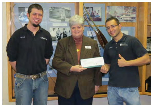
For the 2nd year in a row, Dolphin House was a recipient of the Employee Christmas Funds at Gordon Composites.