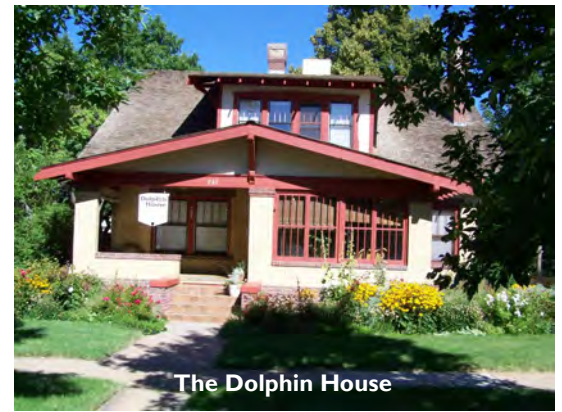
The Dolphin House